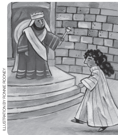
ILLUSTRATION BY RONNIE ROONEY

*Photocopy the Take-Home page at the end of this lesson for each child.