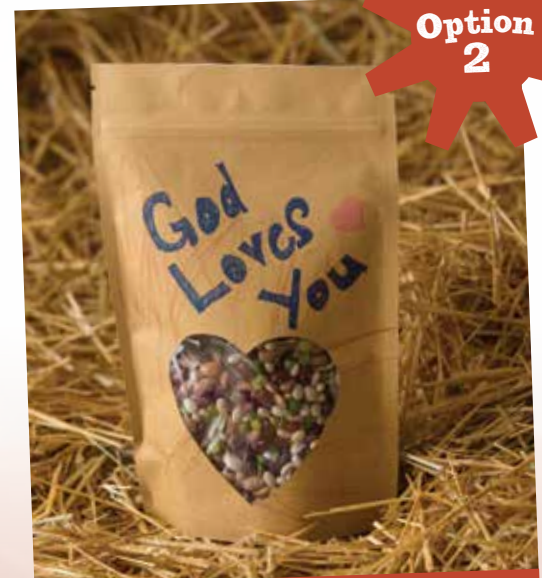
Heart-y Soup Mix